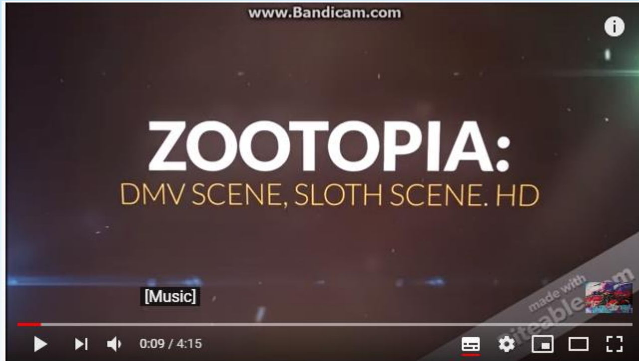
Zootopia: Meet the Sloth. HD ( DMV Scene)